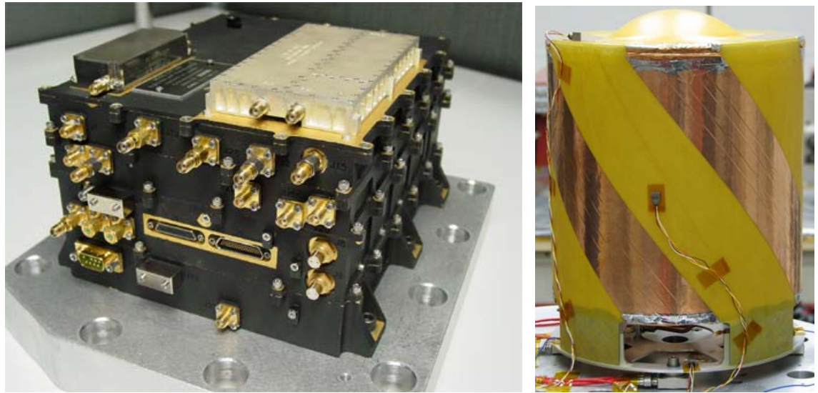
Figure 1: Electra UHF Transceiver and UHF Antenna

As a continuation of this strategy, the 2019 Discovery Announcement of Opportunity requires orbiter missions with one or more Earth-years of expected life in Mars orbit to carry the Electra UHF relay communications payload for feed-forward provision of in-situ telecommunications and navigation services to other MEP missions. The cost of the payload and ground support will be funded by MEP, and these costs are not counted against the overall project cost. In addition, the actual cost of any extended mission operations to support relay services would also be provided by MEP and would not be counted against the overall project cost. However, the proposing project is responsible for any and all costs associated with integrating the payload into the overall flight system, and for implementing the functional capability within the project mission operation system/ground data system required to operate the payload.