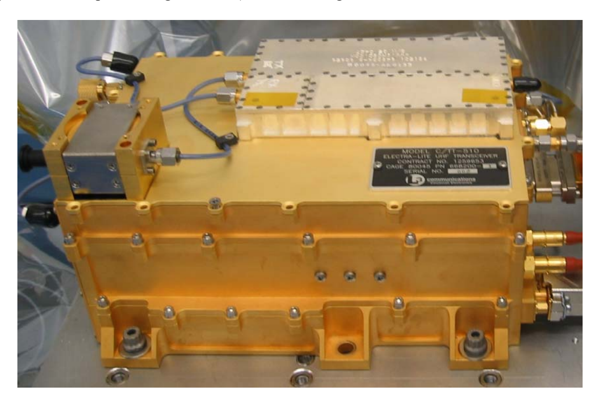
Figure 1: Electra-Lite UHF Transceiver

Unlike the larger orbiter EUT design, which can support both half-duplex and full-duplex operations during flight, the ELT must be configured at the time of manufacture to either half-duplex or full-duplex configuration. (The ELT design for the 2011 Mars Science Laboratory