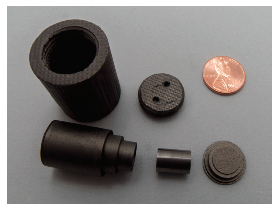
The fuel pellet in an RHU, inside the small metallic cylinder at bottom center in this image, is about the size of a pencil eraser.

A RHU generates about one watt of heat energy from the natural radioactive decay of a small pellet of plutonium dioxide (which consists mostly of plutonium-238). This heat can be transferred directly to spacecraft structures, systems, and instruments, without the need for moving parts or intervening electronic components.