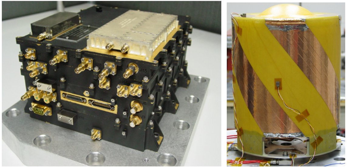
Figure 1: Electra UHF Transceiver and UHF Antenna

As a continuation of this strategy, the 2014 Discovery Announcement of Opportunity requires orbiter missions with one or more Earth-years of expected life in Mars orbit to carry the Electra UHF relay communications payload for feed-forward provision of in-situ telecommunications and navigation services to other MEP missions. The cost of the payload and ground support will be funded by MEP, and these costs are not counted against the overall project cost. In addition, the actual cost of any extended mission operations to support relay services would also be provided by MEP and would not be counted against the overall project cost. However, the proposing project is responsible for any and all costs associated with integrating the payload into the overall flight system, and for implementing the functional capability within the project mission operation system/ground data system required to operate the payload.