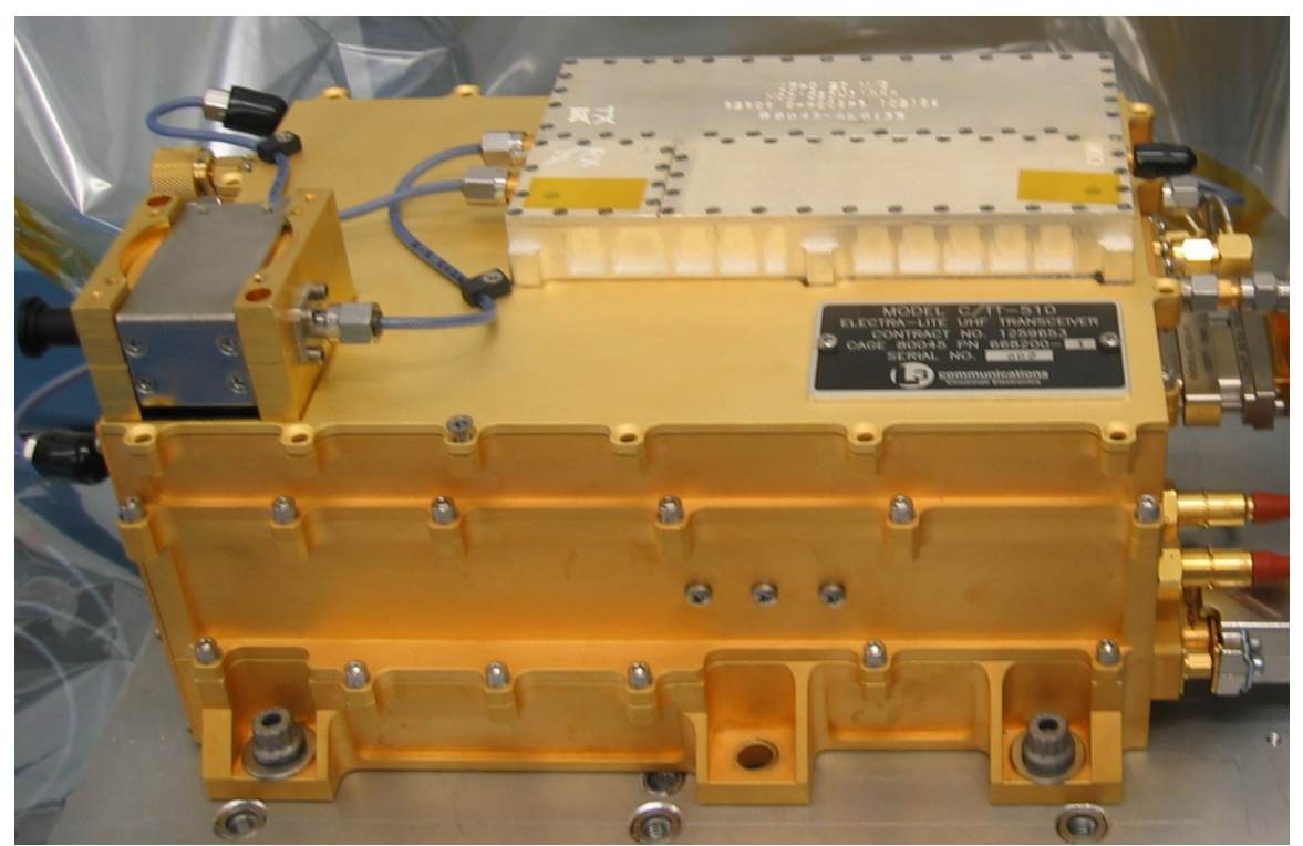
Figure 1: Electra-Lite UHF Transceiver

Unlike the larger orbiter EUT design, which can support both half-duplex and full-duplex operations during flight, the ELT must be configured at the time of manufacture to either half-duplex or full-duplex configuration. (The ELT design for the 2011 Mars Science Laboratory mission utilizes the full-duplex design option.) This is the primary design modification that results in the significant mass and volume reductions for the ELT.